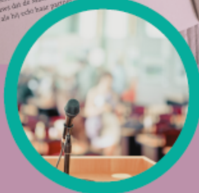
A VARIETY OF PRESENTERS & EDUCATORS