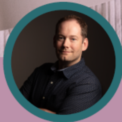
BRANDON MULL BEST-SELLING YA AND MIDDLE GRADE AUTHOR